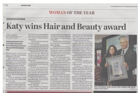
Above: Woman of the Year Award Win Makes headline news...